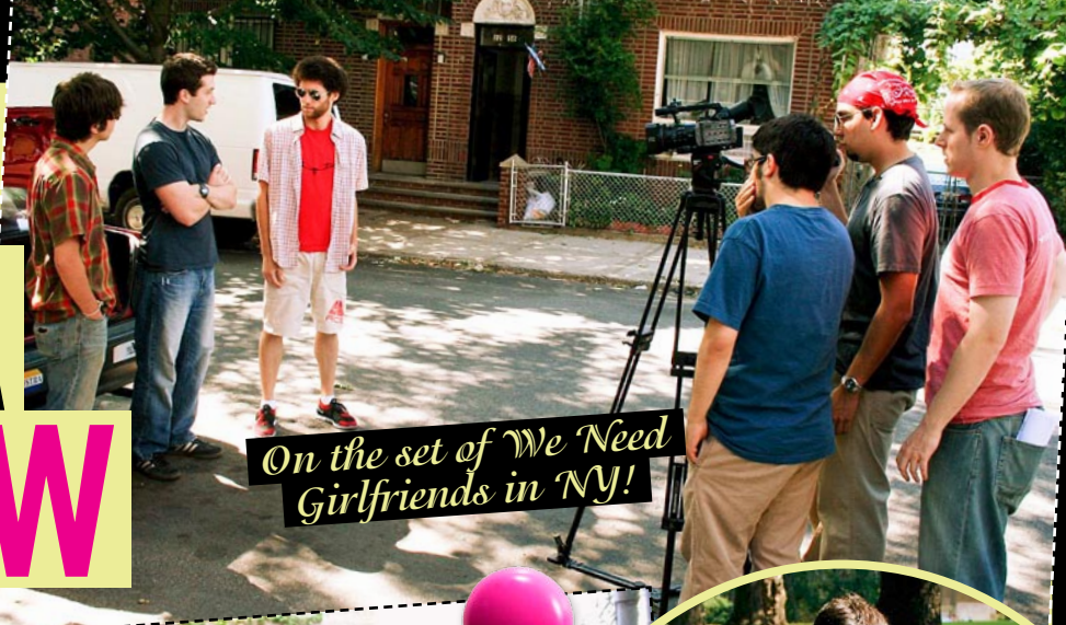
On the set of We Need Girlfriends in NY!