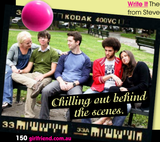
Chilling out behind the scenes.